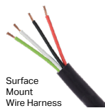
Surface Mount Wire Harness