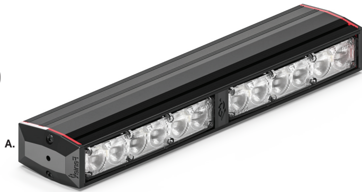
A. Fusion-S 200 Lightstick