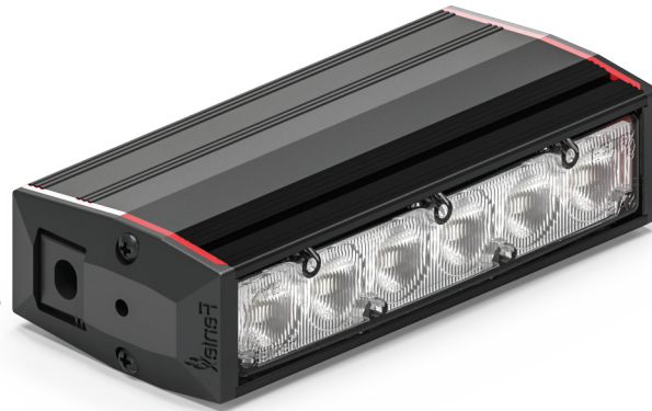
A. Fusion-S 100 Lightstick